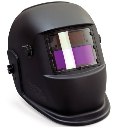
Auto Darkening Helmet

Manufactured with buffalo split leather. Supported with fleece lining and black full welting.